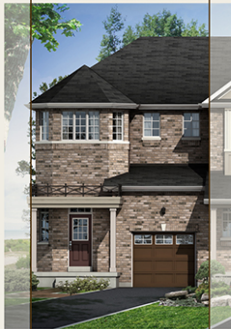
BLOCK 5 - ELEVATION C