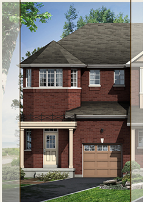
BLOCK 3 - ELEVATION C